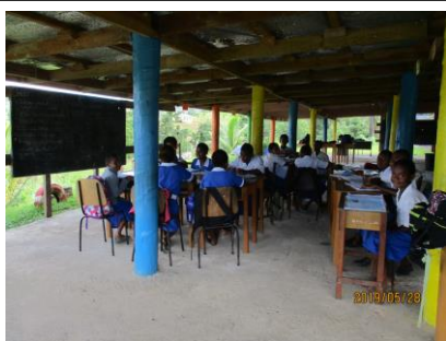
Naivacula District School students using the veranda as a classroom.