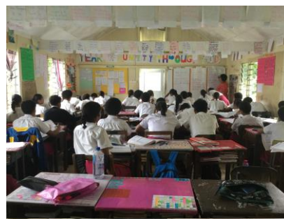
Students using a converted dormitory as a classroom.