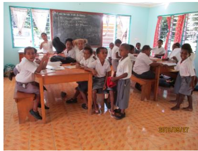
Year 2 students use the staff room as a classroom.