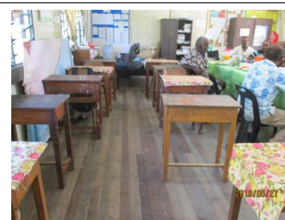
Desks set up for students in the staff room.