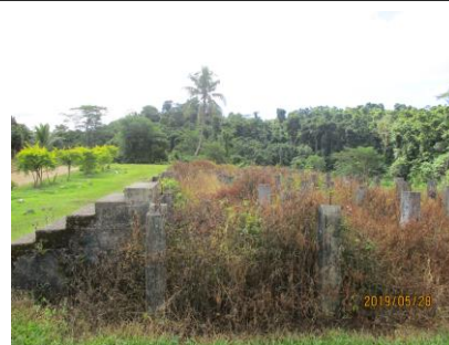
The remains of the classroom block destroyed by TC Winston.