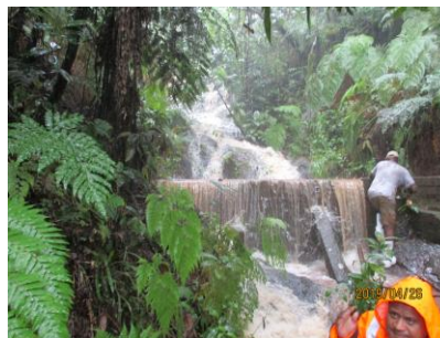
The current dam supplying water to Nakorovou Village, Serua.