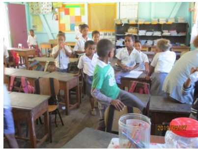
Year 1 students of Tagaqe District School in a crowded class.