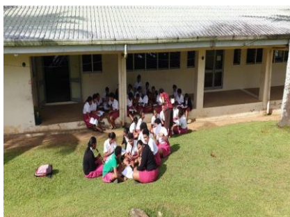
Adi Cakobau School students studying outside.

The GGP Programme is part of the overall Japanese ODA implemented by the Embassy of Japan in order to empower the people from the grassroots level. The GGP Programme in Fiji has been widely implemented in areas such as education, water supply, health, transportation, IT, agriculture and fisheries since 1990. To date, 372 projects have been implemented under the GGP Programme which amount to an approximate value exceeding USD 25 million.