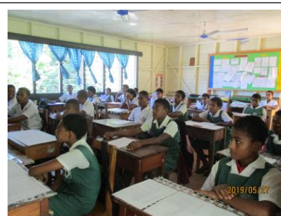
Year 8 students using the library in Sigatoka District School.