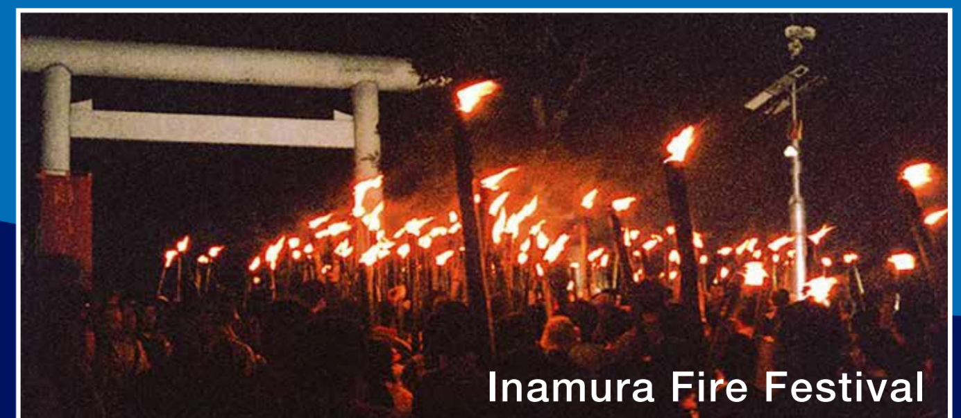
Inamura Fire Festival