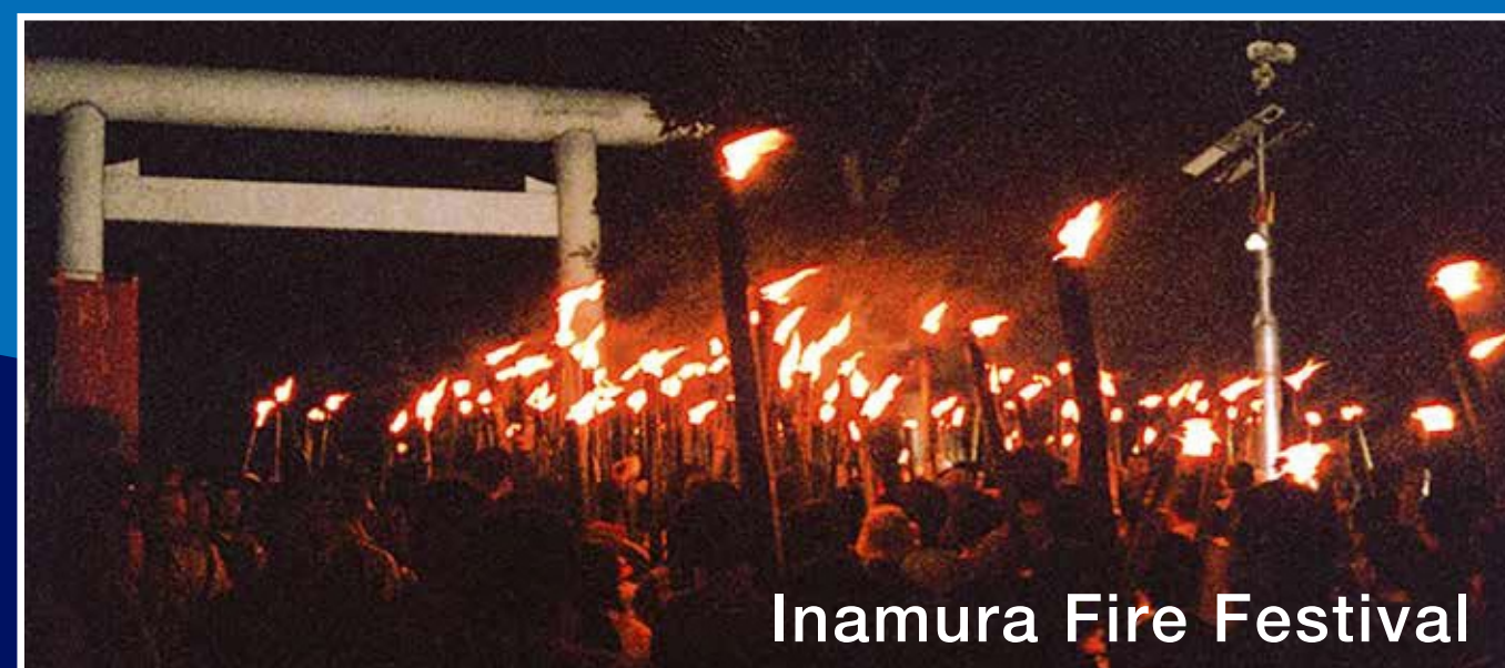
Inamura Fire Festival

Please check the web site for details https://tsunami2018wakayama.telewaka.tv