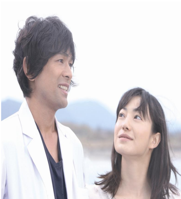
(c) 2010 "Permanent Nobara" Film Partners

Tickets will be available at Village 6 Cinemas Ticket Booth on the actual dates of screening. First-come first-served service.